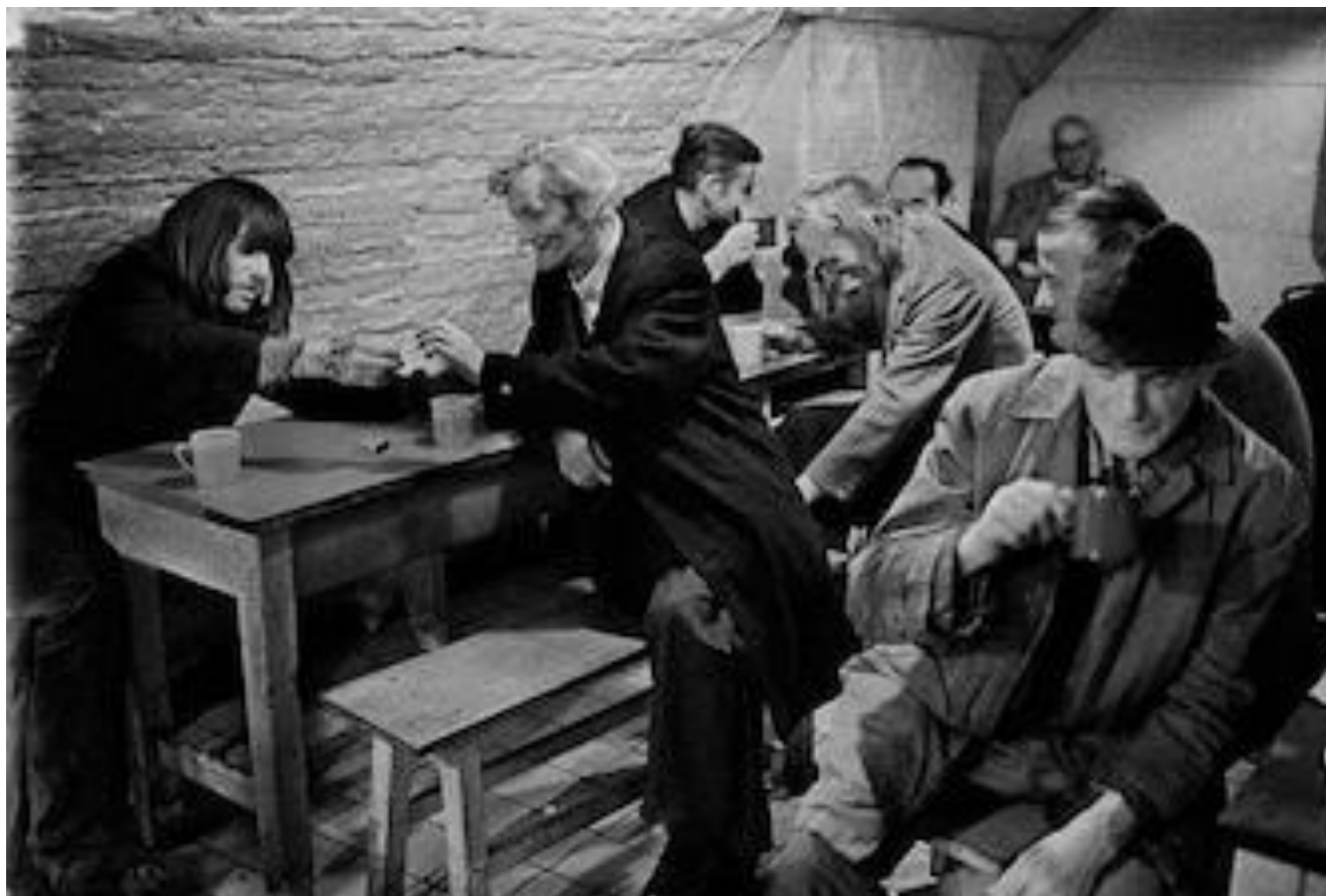
St Botolph's Crypt 'wet shelter', 1978

In 1962 he was ordained and went as one of several curates in the large and dynamic parish of St Mark, North End, Portsmouth. He was happy to remain there for five years before becoming chaplain of Queen Mary College, London, where he began his long commitment to ministry in the East End.