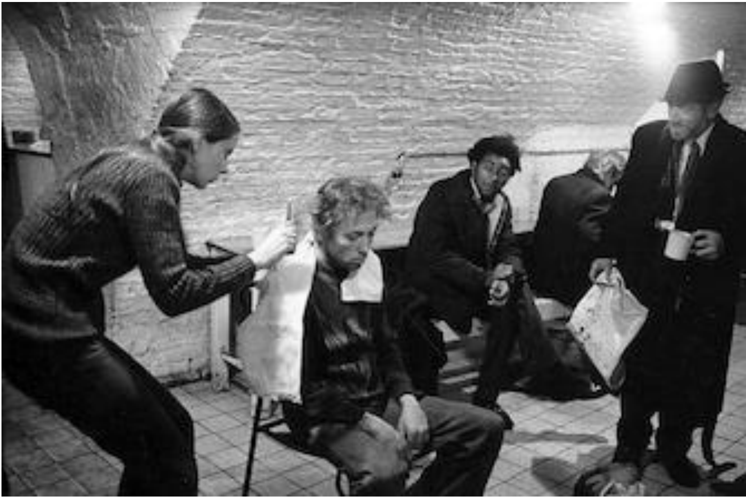
A volunteer cutting a homeless man's hair at St Botolph's Crypt 'wet shelter', 1978