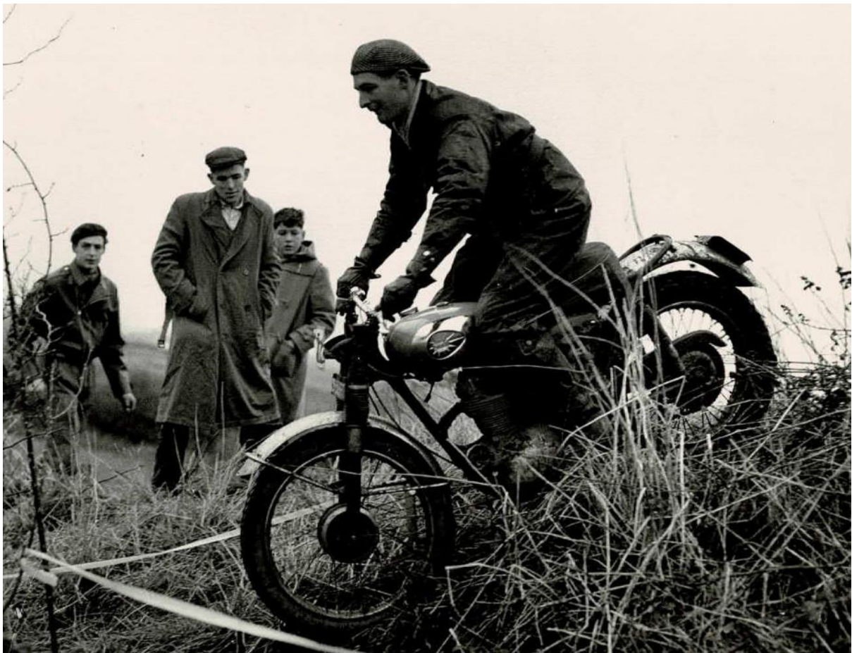
Captured mid event ( not sure of date)