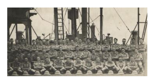
'A' Troop, 337 Battery, 85th Field Regiment R.A. (T.A.) aboard the Highland Monarch en route to North Africa.