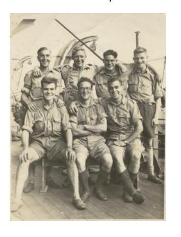
Pals of 85th