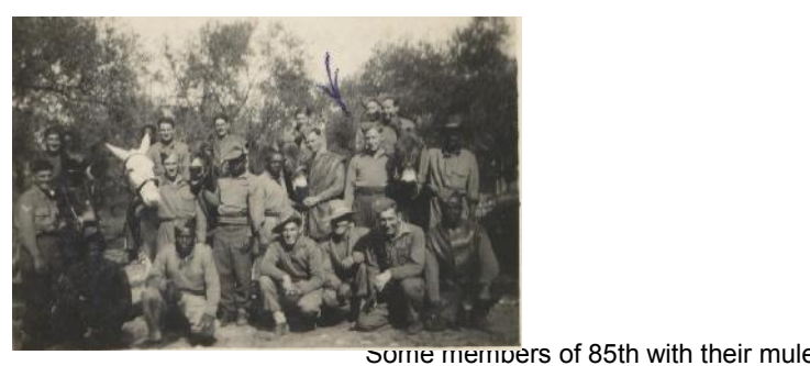
Some members of 85th with their mules and Basuto Drivers