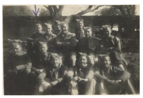
Mountain training in Lebanon for some of 85th Mountain Regiment R.A. (T.A.)